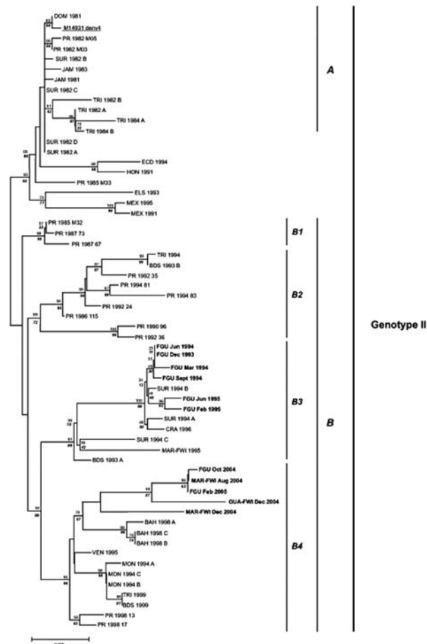
Figure. Phylogenetic tree of American dengue virus type 4 (DENV-4) strains generated by using the neighbor-joining algorithm with Kimura 2 parameter distance. Numbers above branches refer to bootstrap values generated by using distance, and numbers under nodes refer to bootstrap values generated by using parsimony. Names of isolates refer to country and are listed in the Table. Accession no. M14931 refers to the complete genome of DENV-4. A and B refer to the 1981 introduction group and to the modern Caribbean clade, respectively, and B1-B4 correspond to 4 different lineages within group B, as previously reported by Foster et al. (8).