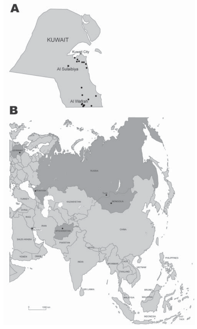
Figure 1. A) Kuwait, with location of subtype H5N1 virus outbreaks in 2007. Circles indicate location of farms with confirmed influenza (H5N1) infections in poultry; square indicates the Al Sulaibiya area where virus isolation was conducted. B) Eurasia, with location of subtype H5N1 isolates phylogenetically related to Kuwait isolates.

On February 13, 2007, the Public Authority for Agriculture and Fisheries of Kuwait reported the initial outbreak of influenza (H5N1) in poultry in the Al Wafrah farm area in southern Kuwait. Subsequently, 131 influenza virus (H5N1)–infected poultry were confirmed from 20 farms throughout the country (Figure 1, panel A). The disease resulted in high mortality rates among infected flocks, especially in the commercial broiler farms in Al-Wafrah and among poultry raised in privately owned residential homes and backyard farms. Disease control measures were implemented beginning February 18, 2007, including control of poultry movement, vaccination, disinfection of infected premises, and culling of \approx 500,000 birds. The final case of subtype H5N1 was detected on April 20, 2007, and