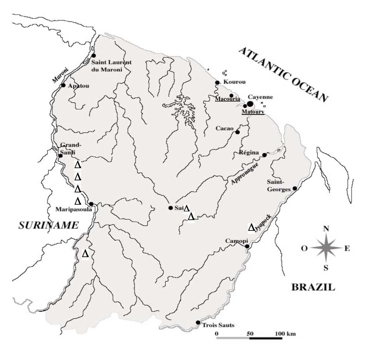
Figure I Map of French Guiana. Triangles indicate the localization of the severe malaria cases with KI-B/var D described by Ariey et al. [3]. The towns of Macouria and Matoury are indicated.

up to 99% and 97% identity, respectively. However, no isolate in the database had precisely similar tri-peptide repeats as B-K1 or A-K1. This is in line with recent evidence indicating that msp1/block 2 (and msp2 ) repeats evolve at a faster rate than SNPs in the non-repeated domains [10]. Numerous isolates showed in addition sin-