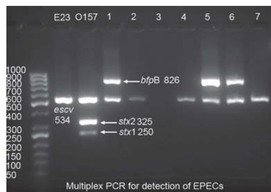
Figure 1: Multiplex PCR for detection of EPECs. Lanes 1-7 showing strains identified as typical and atypical EPEC.

This multiplex PCR differentiates STEC and EPEC and also divides the later into two groups, i.e. typical and atypical EPEC. Strains with escv+ , bfp+ traits are considered typical and isolates with escv+ , bfp- are atypical EPEC. The PCR was performed in a 25 µL reaction mixture consisting of 1 U of Taq DNA polymerase with the corresponding Taq polymerase buffer, a 0.3 mM concentration of each deoxynucleoside triphosphate, and a 0.4 mM concentration of each PCR primer. Thermocycling conditions were as follows: 95°C for 5 min, followed by 30 cycles of 95°C for 1 min, 58°C for 1 min, and 72°C for 1 min, with a final extension at 72°C for 5 min. The sequence of primers and expected PCR product with the appropriate size are shown in Table 1. The PCR products hence obtained were run on 1% gel and the gels were visualized by gel Doc system (Figure 1).