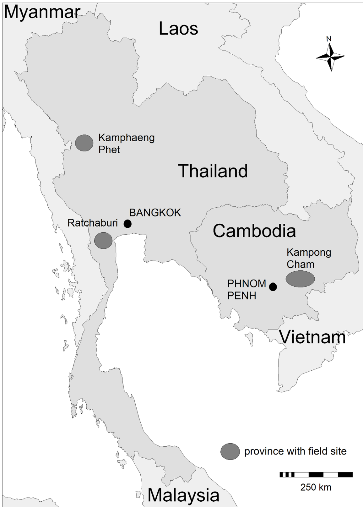
Figure 1. Geographic location of provinces with dengue field sites in Thailand and Cambodia. The field sites were members of a dengue field site consortium and provided prospective cohort data to be compared with the dengue reporting data in the same province. doi:10.1371/journal.pntd.0000996.g001