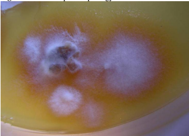
Three weeks' culture of Microsporum langeronii on Sabouraud's Dextrose Agar incubated at 30°C. The colonies are white and flat with a furlike mat having radiating edges.