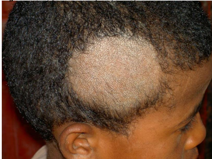
GPTC occurring in a young boy's scalp of Anosizato primary public school, Antananarivo, Madagascar