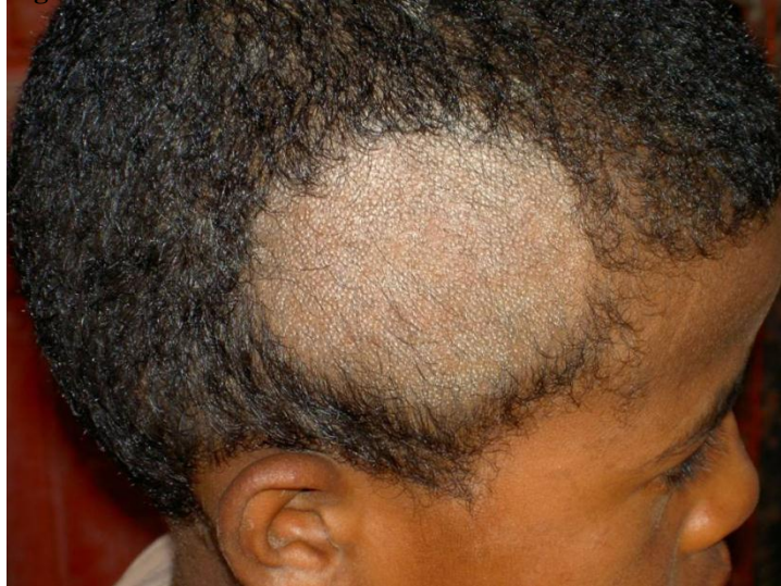
GPTC occurring in a young boy's scalp of Anosizato primary public school, Antananarivo, Madagascar