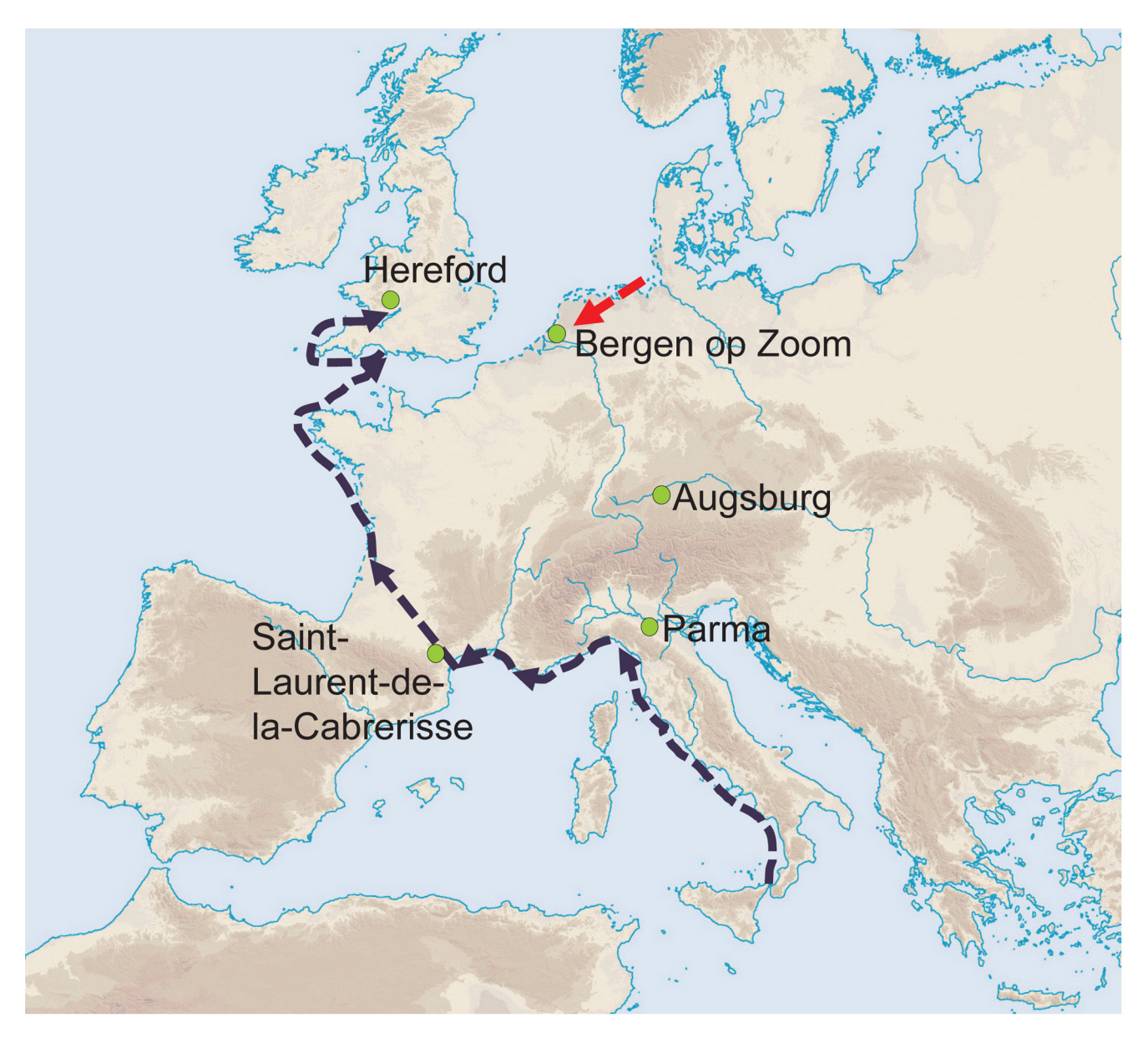
Figure 1. Geographical position of the five archaeological sites investigated. Green dots indicate the sites. Also indicated are two likely independent infection routes (black and red dotted arrows) for the spread of the Black Death (1347–1353) after Benedictow [25]. doi:10.1371/journal.ppat.1001134.q001

Similar to the aDNA results, antigen was not detected in negative control samples or in soil samples from those sites (Tables 1 and S1).