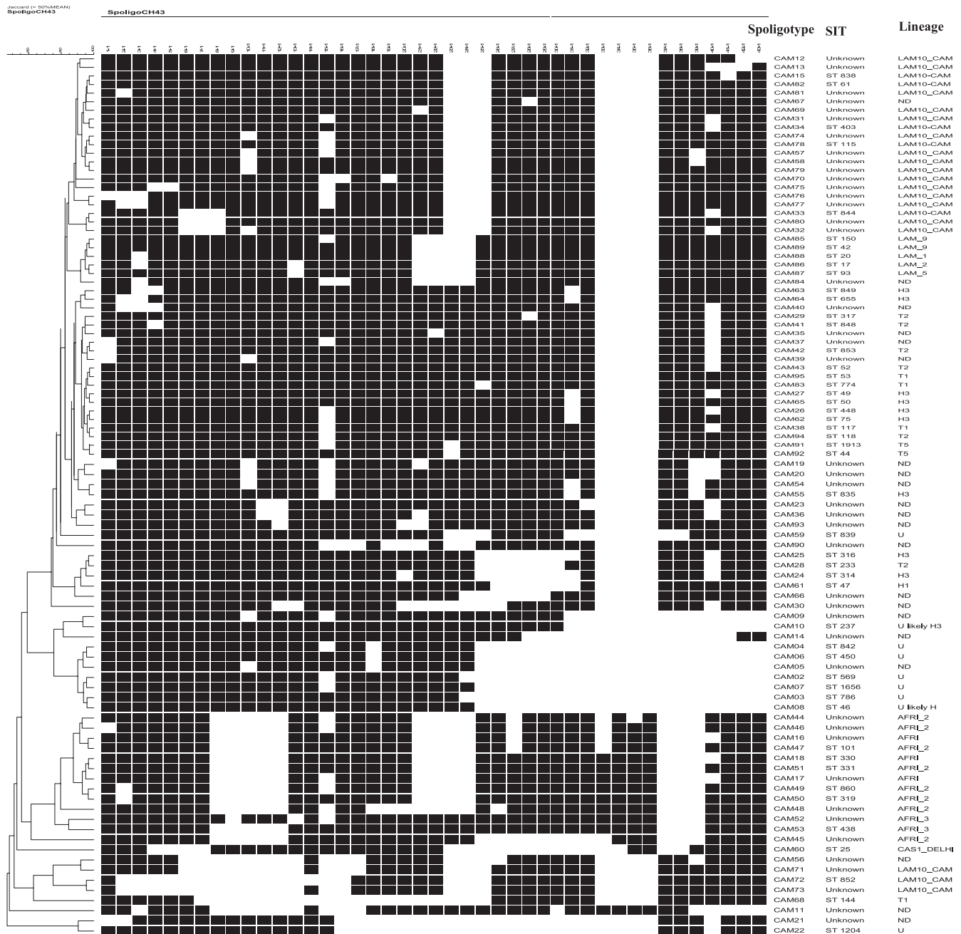
FIG 1 Dendrogram and schematic representation of 94 spoligotypes identified from 565 M. tuberculosis complex strains isolated from positive pulmonary tuberculosis patients from West Cameroon. The degree of similarity of spoligotypes was calculated with the 1-Jaccard index, and the relationships between patterns were assessed by the unweighted-pair group method using average linkages. The spoligotype code, the shared international type (SIT), and lineage are listed. ND, not determined. CAM, Cameroonian spoligotype corresponding to a strain isolated in this study.

49 patterns matched those found in SpolDB4 and 45 were identified as novel (Fig. 1).