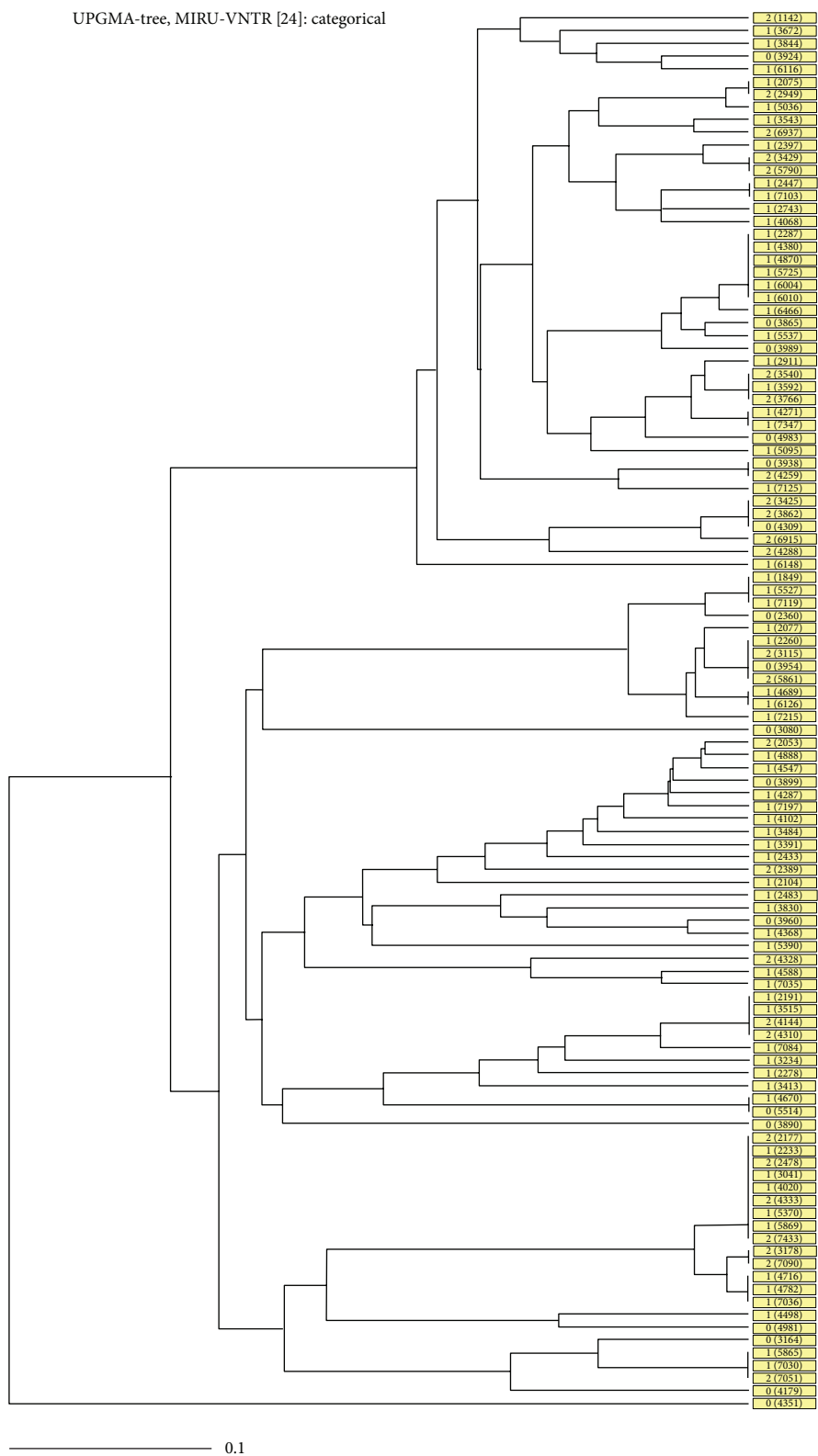
FIGURE 2: UPGMA tree based on MIRU 24 pattern of the subset of 110 samples. Drug resistance (Drug R) information is shown as 0, unknown; 1, non-MDR; 2, MDR-TB, that is, combined resistance to INH-RIF (with or without resistance to other drugs).