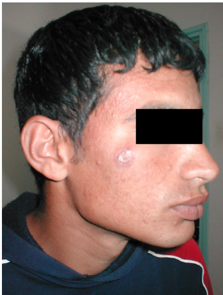
Figure 3. Dry and slightly inflammatory single lesion of the face due to L. tropica .

Most of the L. infantum -infected patients have a single, small, ulcerated, and crusty lesion on the face surrounded by a significant zone of infiltration (Fig. 4) [26].