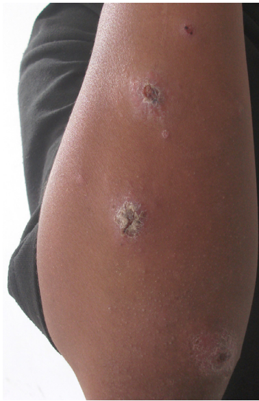
Figure 2. Multiple ulcerous lesions with scabs of the forearm due to L. major .