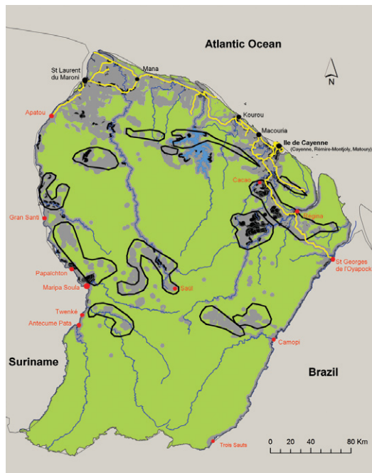
Fig. 1: geography of French Guiana. Only the main rivers are represented. The rainforest is in green. The areas facing anthropic impact are represented in gray (medium) and black (high) (de Thoisy et al. 2010). Gold wealth subsoil is circled in black. The entire road network is represented in yellow. All towns and villages located in a malaria endemic area and reporting malaria cases are represented in red. In these latter, cares are provided only by a health centre.

occurred along the Maroni and Oyapock rivers, representing 80% and 20% of the cases, respectively. Along the Maroni, the incidence of 360 cases per 1,000 inhabitants was almost exclusively linked to Plasmodium falciparum (Strobel et al. 1985, Esterre et al. 1990). Very few Plasmodium malariae cases were observed each year in this part of the region. This species was very similar to Plasmodium brasilianum , transmitted by monkeys in the wild. In fact, these two species may be one and the same in this region (Fandeur et al. 2000, Volney et al. 2002). Plasmodium vivax has always been rare along the Maroni, where the population is predominantly composed of Maroon people of African descent with a natural resistance to this parasite species; cases only occurred in some Amerindian communities in the upper part of the river. On the Oyapock side, the incidence in the 80s was about 485 cases per 1,000, of which 30% of cases were due to P. vivax (Juminer et al. 1981). Little transmission was observed in the coastal area (incidence 9.3 cases per 1,000 inhabitants).