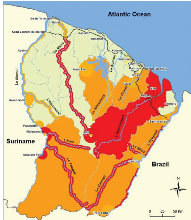
Fig. 3: risk of malaria in French Guiana between September 2012 and March 2013. This map represents the risk of malaria contamination at the municipality scale. This risk is calculated from the number of registered malaria cases, the presence of Anopheles vector and gold mining activities in the municipality. Municipalities with very low risk of malaria are represented in yellow. Orange represents low risk and red, the highest risk. Between April and August, the three municipalities on the east, namely St Georges de l'Oyapock, Camopi and Trois Sauts, are generally at low risk because of the seasonality of transmission.

Control strategy and current issues - Test, treat... - The test and treat strategy relies on a network of public and private professionals that enables patients to be diagnosed and treated close to their homes (Fig. 1). The private medical sector is composed of one hospital in Kourou and a number of general practitioners (n = 371), medical laboratories (n = 7) and pharmacies (n = 47). Drug distribution is well regulated and follows French Agency for Drug Safety directives. The public health sector is composed of hospitals in the two main towns of French Guiana - one in Saint Laurent du Maroni and