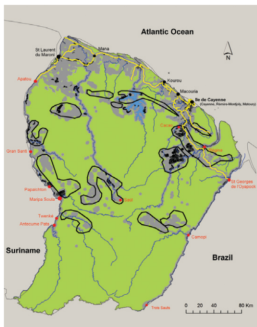
Fig. 1: geography of French Guiana. Only the main rivers are represented. The rainforest is in green. The areas facing anthropic impact are represented in gray (medium) and black (high) (de Thoisy et al. 2010). Gold wealth subsoil is circled in black. The entire road network is represented in yellow. All towns and villages located in a malaria endemic area and reporting malaria cases are represented in red. In these latter, cares are provided only by a health centre.

occurred along the Maroni and Oyapock rivers, representing 80% and 20% of the cases, respectively. Along the Maroni, the incidence of 360 cases per 1,000 inhabitants was almost exclusively linked to Plasmodium falciparum (Strobel et al. 1985, Esterre et al. 1990). Very few Plasmodium malariae cases were observed each year in this part of the region. This species was very similar to Plasmodium brasilianum , transmitted by monkeys in the wild. In fact, these two species may be one and the same in this region (Fandeur et al. 2000, Volney et al. 2002). Plasmodium vivax has always been rare along the Maroni, where the population is predominantly composed of Maroon people of African descent with a natural resistance to this parasite species; cases only occurred in some Amerindian communities in the upper part of the river. On the Oyapock side, the incidence in the 80s was about 485 cases per 1,000, of which 30% of cases were due to P. vivax (Juminer et al. 1981). Little transmission was observed in the coastal area (incidence 9.3 cases per 1,000 inhabitants).