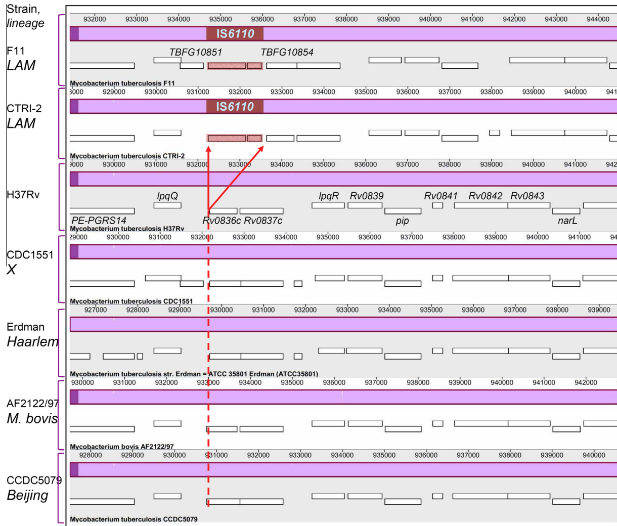
Fig. 2 – Specific IS6110 insertion characteristic of the LAM family. Complete genomes of M. tuberculosis strains were retrieved from GenBank and aligned using Mauve 2.3.1 program ( http://darlinglab.org/mauve/mauve.html ).

( MIRU-VNTRplus.org ) defines the family of these strains as TUR, based on the analysis of different molecular markers, including VNTRs and SNPs. It is also interesting to note that all studied strains of the SIT125, which had an uncertain family definition (LAM/S in earlier SpoIDB4 and T2/LAM3 in SITVIT_WEB), did not have a LAM-specific band; hence their family status cannot be LAM. Finally, two strains of SIT1588 had a single non-LAM band which is intriguing, since these strains had a prototype LAM signature (see SIT42 in Fig. 1), in addition to the deleted first signals. This profile may be a result of the convergent evolution of the DR locus, and more strains of this spoligotype SIT1588 should be studied in order to verify its family status.