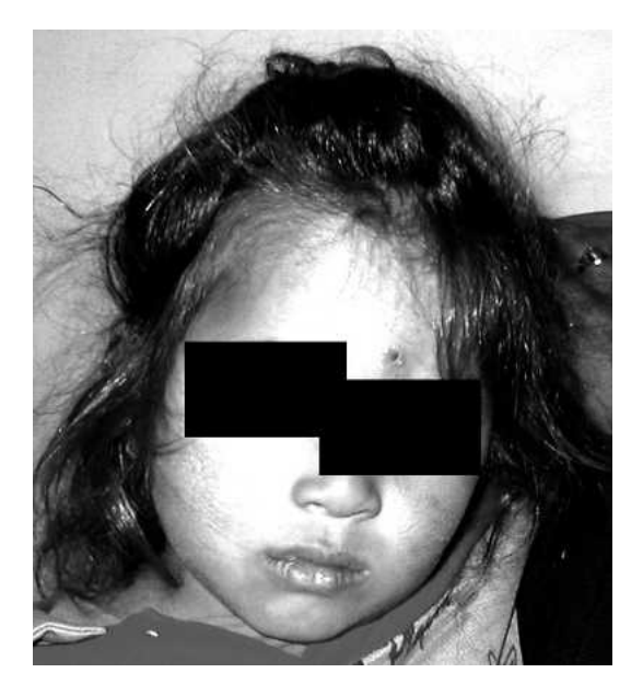
Fig. 2. - Small lesion, weakly infiltrated due to L. killicki.