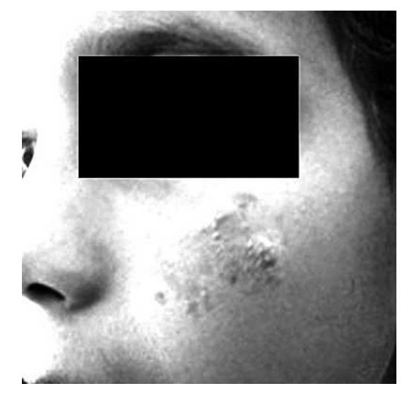
Fig. 4. – Satellite lesions at the periphery of the scar (Focus of Metlaoui).