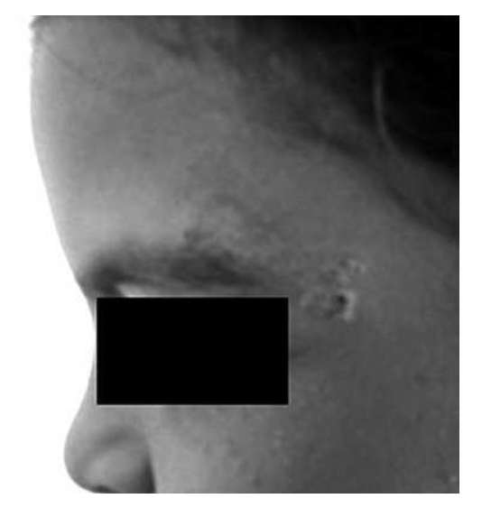
Fig. 5 – Dry face lesion due to L.\ killicki (Focus of Metlaoui).

tion, lasting frequently several years (Rioux et al. , 1986).