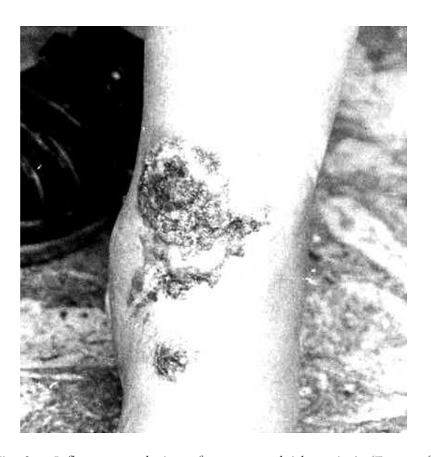
Fig. 3. – Inflammatory lesion of cutaneous leishmaniasis (Focus of Aı̈n Jloula).