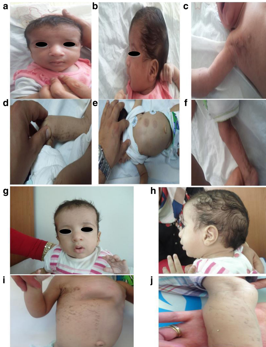
Fig. 1 Photographs of the patient showing NS and IP manifestations. a, b front and profile photo respectively pointing facial dysmorphism at the age of 1 month with broad forehead, hypertelorism, down-slanting palpebral fissures, a high arched palate, bifid uvula and low set posteriorly rotated ears, long philtrum and epicanthal folds; c-f typical IP manifestations at the age of 1 month showing linear brownish pigmentation involving the trunk and the extremities; g, h front and profile photo of the patient at the age of 1 year highlights the evolution of NS phenotype; i, j evolution of the IP manifestations at the age of 1 year, pectus excavatum becomes more pronounced

visually inspected using the Integrative Genomic Viewer (IGV) before validation by Sanger Sequencing using the manufacturer's protocol for BigDye ® Terminator sequencing kits. Segregation analysis was performed in both parents by Sanger sequencing.