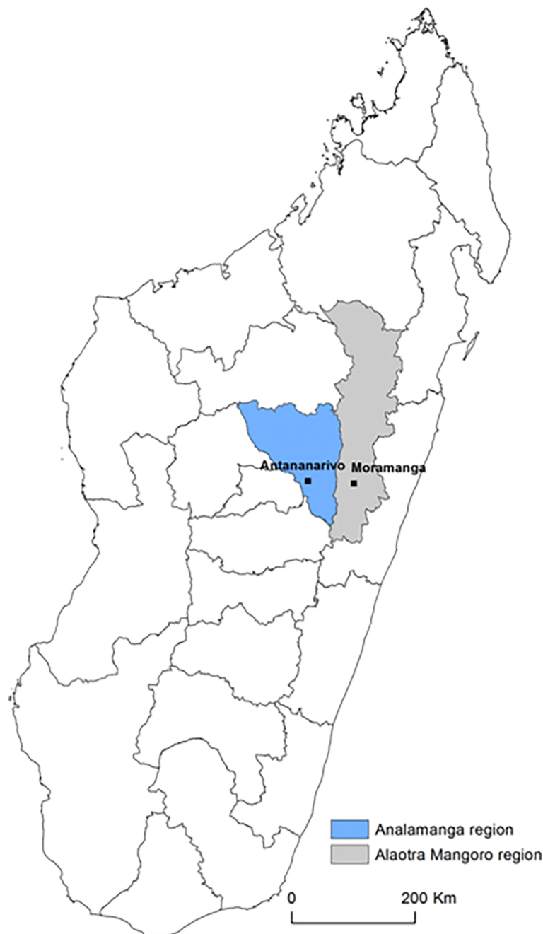
Fig 1. Study areas.

The mother's sociodemographic, medical and obstetric characteristics and delivery information were also collected as well as the newborn's anthropometric measurements and APGAR score.