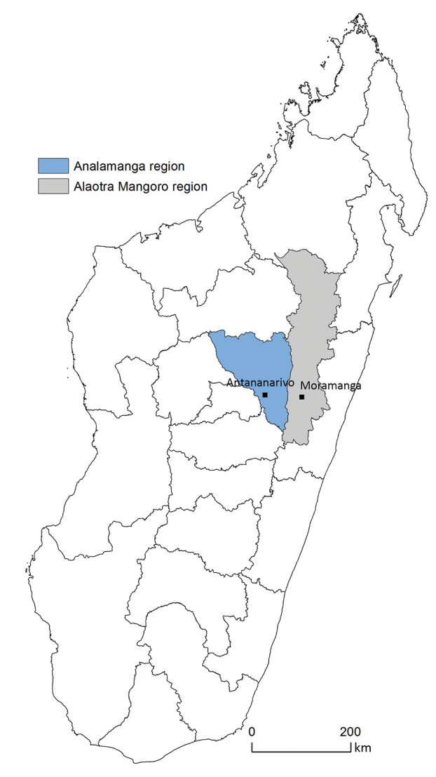
Figure 1. Locations of Antananarivo and Moramanga in Madagascar.

We collected fecal samples from the mothers perinatally to test for extended-spectrum \beta -lactamase (ESBL)–producing Enterobacteriaceae . We also collected the mothers' sociodemographic, medical, and obstetric characteristics; delivery information; and the neonates' anthropometric measurements and Apgar scores.