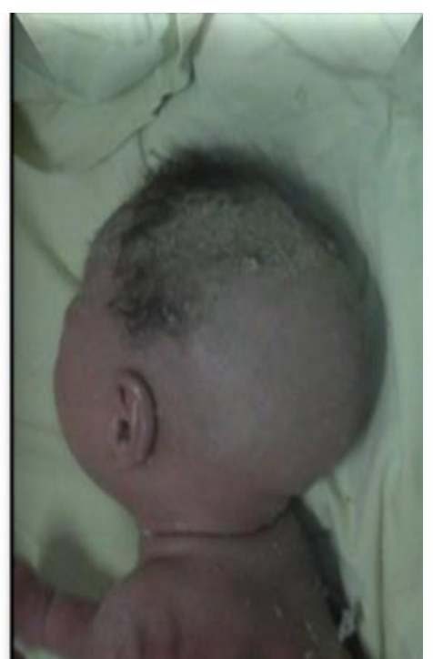
Figures 3 and 4. Erythroderma with alopecia in a patient with Omenn syndrome.