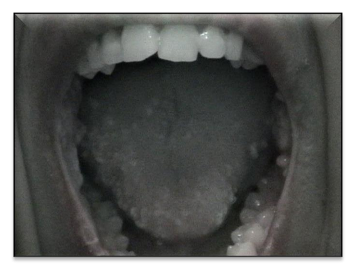
Figure 1. Disseminated warts on oral cavity in a patient with MHC class II deficiency.

In this study, oral candidiasis was the most common infection in patients with CID, frequently associated with broncho-pulmonary infections (61 cases, 66.30%), digestive infections (56 cases, 60.9%), ear, nose, and throat infections (23 cases, 25%) and persistent diarrhea resulting in failure to thrive (39 cases, 42.4%). Mucocutaneous lesions due to candida were more frequently oral, whitish,