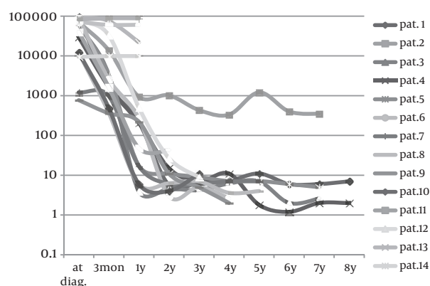
Figure 2. Alpha Fetoprotein (AFP) During Treatment in 16 Patients