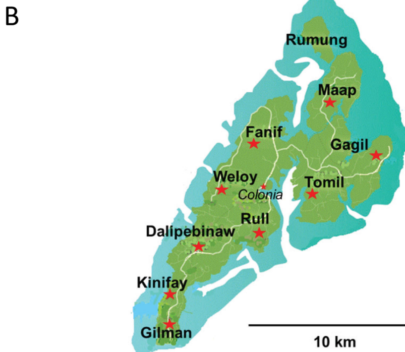
Figure 1. Maps showing size and locations of Yap State (A) and sites of collections on Yap Island (indicated by stars) (B). doi:10.1371/journal.pntd.0003188.g001