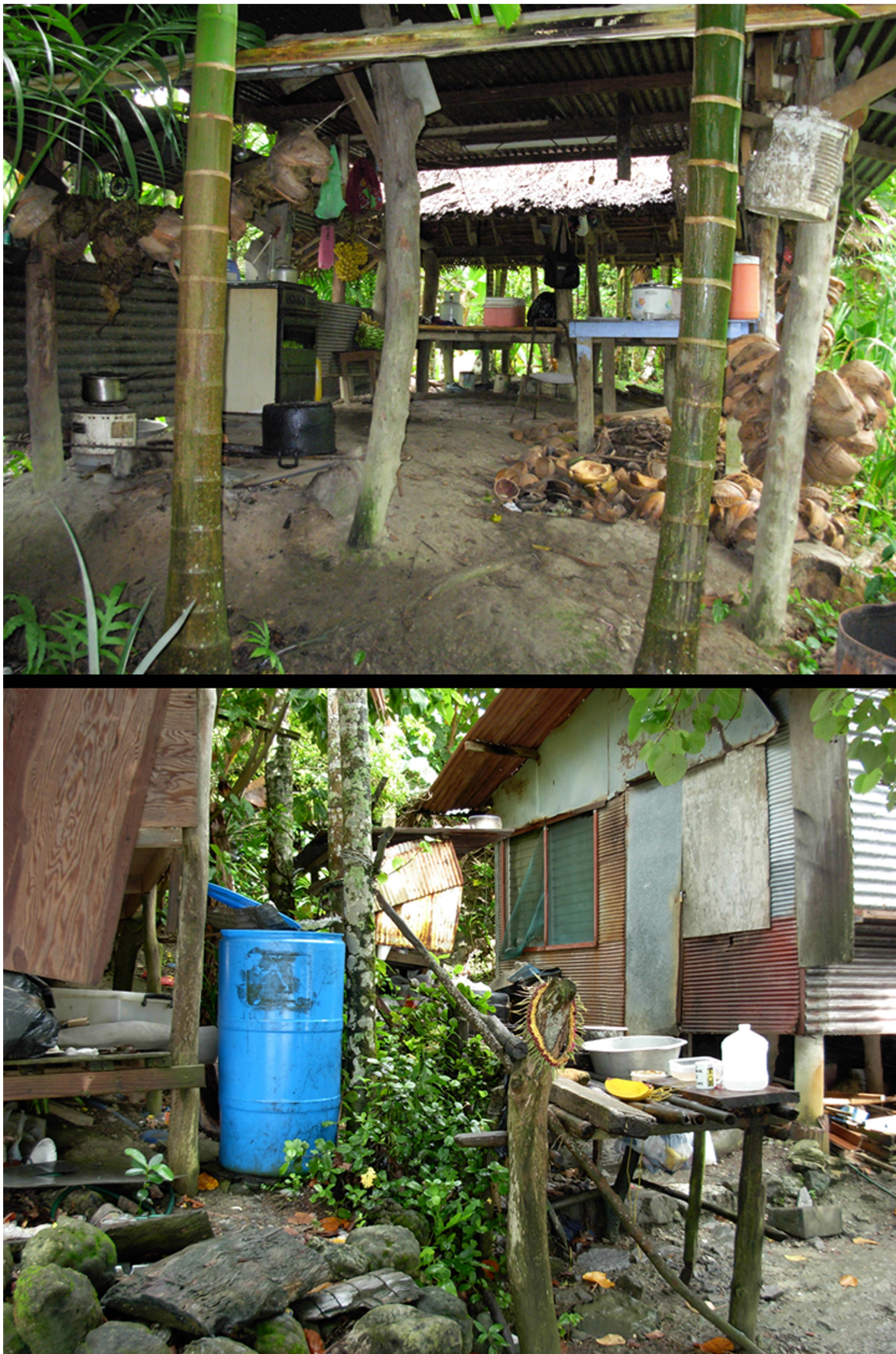
Figure 2. Typical water holding containers at individual homes including water barrels, coconut shells and cooking utensils. doi:10.1371/journal.pntd.0003188.g002