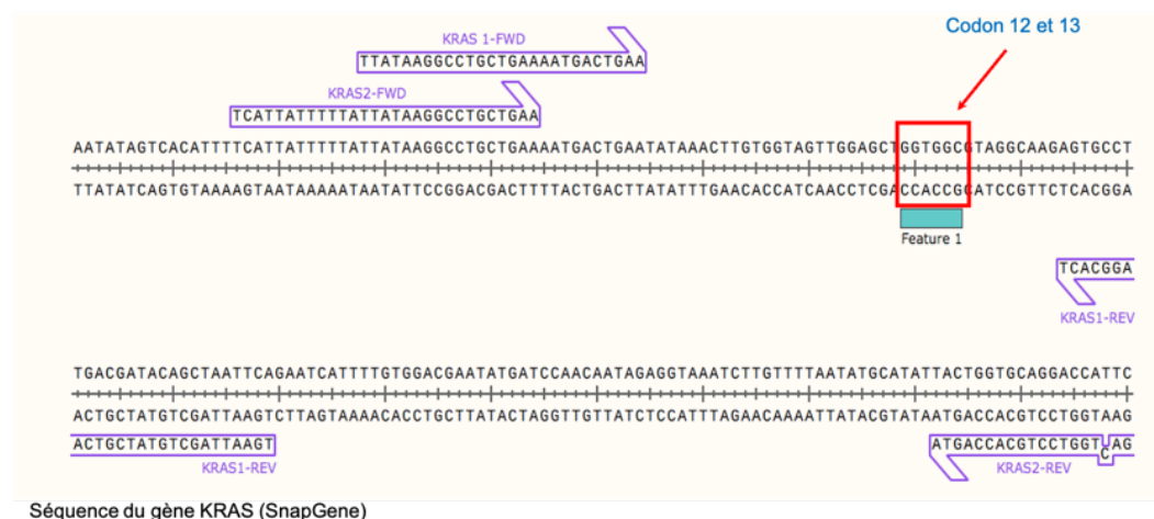
Figure 1. Representation of a portion of the KRAS gene. Boxed in red, codons 12 and 13 of exon two of the gene. Purple box: the sequence of primers used for the amplification