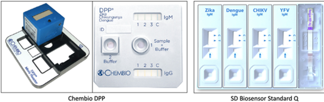
Figure 1. Chembio Diagnostics DPP ® ZCD IgM/IgG (Zika/Chikungunya/Dengue IgM/IgG) System and SD Biosensor (SDB) STANDARD Q Arbo Panel Test. The Chembio ZIKV, CHIKV, and DENV multiplex serology assay system consists of a single cassette where the sample and buffer are placed are placed into a well marked 1 and a second buffer added into well 2. The results are read by placing a RFID microreader over the IgM and IgG windows where result for Zika antibodies can be read in Line 1, chikungunya virus antibodies in Line 2, dengue virus antibodies in Line 3 and C is the control line. For the Chembio Diagnostics DPP ® Zika IgM/IgG System, the test cassette is similar to the ZCD IgM/IgG system except that each result window only contains 2 lines, one for the zika antibodies and the other for the control line (picture not shown) . SD Biosensor (SDB) STANDARD Q Arbo Panel Test: the SD Biosensor assay is an immuno-chromatographic assay for the detection of Dengue NS1 Antigen and IgM antibodies to Zika/Dengue/Chikungunya/Yellow fever virus. It consists of 5 separate cartridges, where each requires specimen and buffer addition. The results can be read visually.