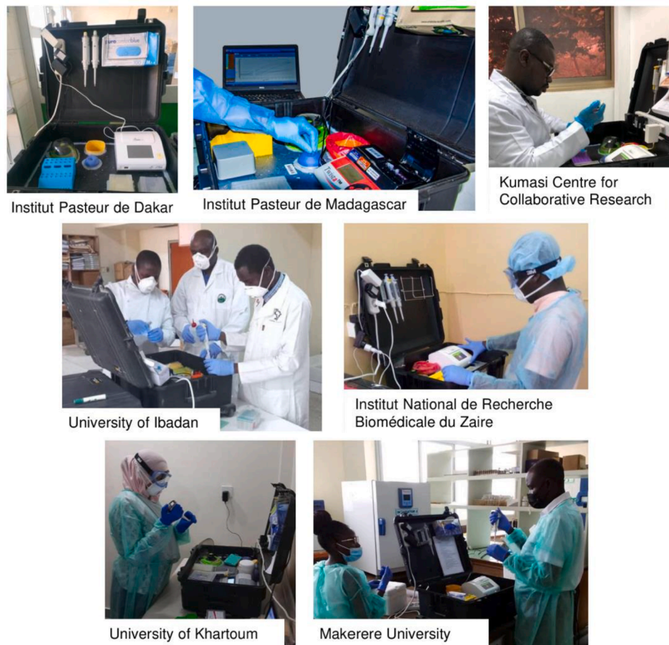
Fig. 4. The suitcase lab at various study sites.