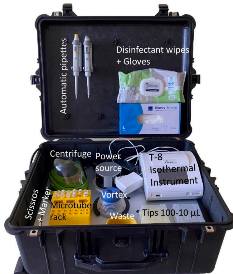
Fig. 3. Example of the suitcase lab, which is fully equipped to perform molecular tests in the field.

based on a previous study [8] Primer and probe were synthesized by TIB MOLBIOL (Berlin, Germany). The RT-RAA nucleic acid amplification kit (Fluorescent RT-RAA) from Jiangsu Qitian Gene Biotechnology Co. (Wuxi, China) was used. The kit comprises lyophilized enzymes, including the reverse transcriptase necessary for RNA amplification. The RT-RAA reaction total volume was 50 \mu\text{L} including 21.5 \mu\text{L} of the oligonucleotide mix (21 pMol for forward primer, 42 pMol for reverse primer and 6 pMol for exo-probe), 25 \mu\text{L} rehydration buffer, 2.5 \mu\text{L} Magnesium Acetate and 1 \mu\text{L} template or control. The mix was added into the lid of the reaction tube containing the freeze-dried pellet. The tube was closed, centrifuged, mixed, centrifuged, and placed immediately into the isothermal device: UofK and IPM used the TwistDx TS1 device (Cambridge, UK). UI used the Qiagen ESequant TS2 model (Hilden, Germany), while all other countries used the Axxin T8 Isothermal instrument (Fairfield, Australia). The reaction was incubated at 42 ^{\circ}\text{C} for 15 min. A mixing step was conducted after 320 s for the N gene assay and after 230 s for the RdRP gene assay. For signal interpretation, a combined threshold time (TT) and first derivative analysis was used with the corresponding software of each device.